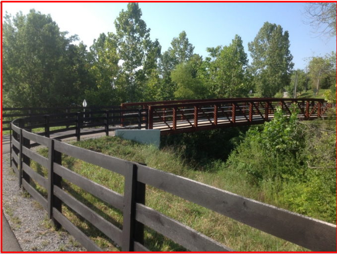
New structure installed over Chenoweth Run (Looking south)