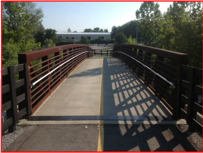
New structure over Chenoweth Run (Looking east)