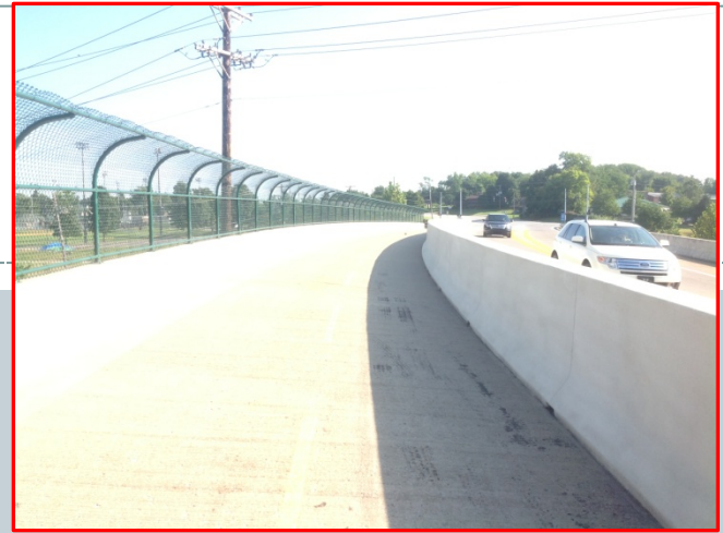
Pedestrian cage over the railroad and concrete barrier between path and roadway (Looking north)