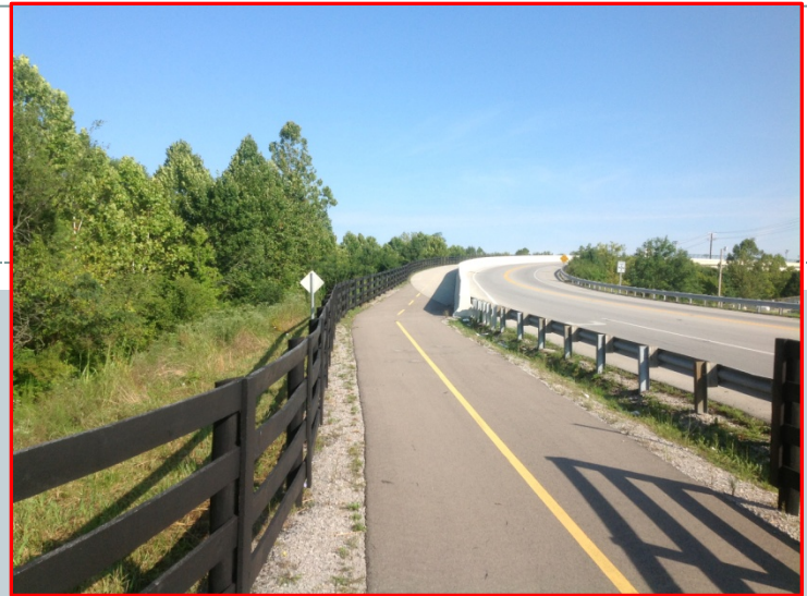
Area where the path enters the existing roadway (Looking north)